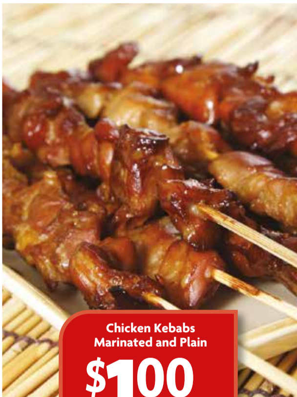
Chicken Kebabs Marinated and Plain