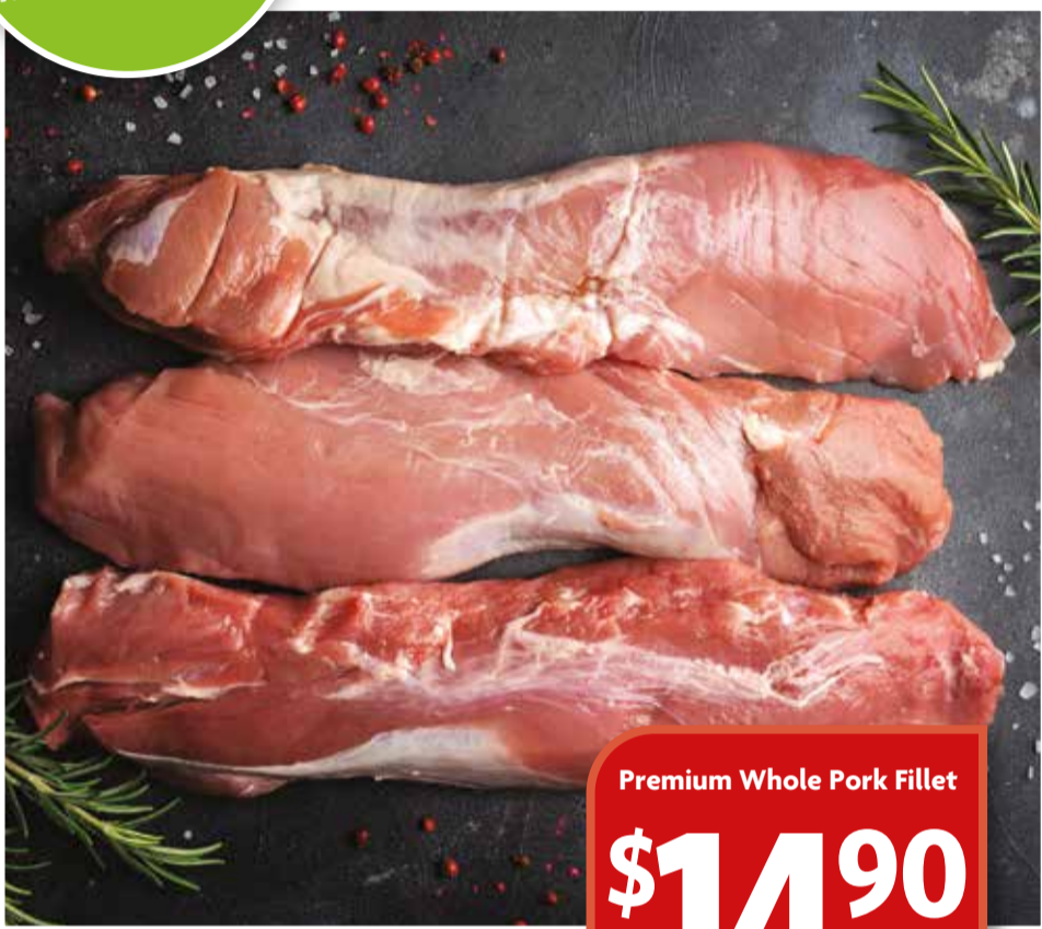
Premium Whole Pork Fillet