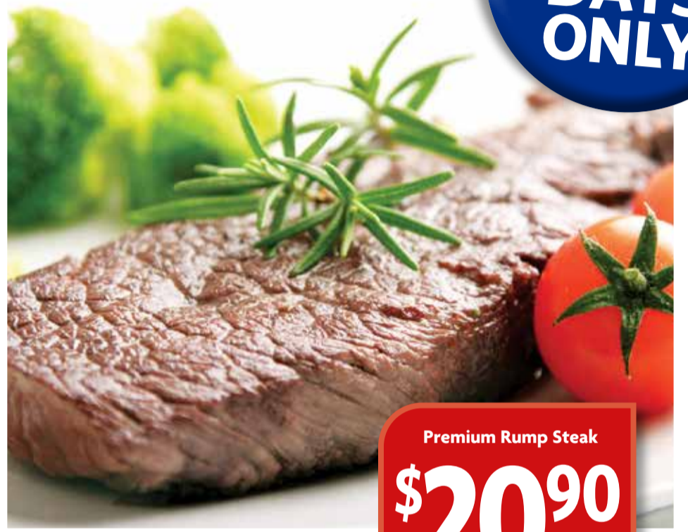
Premium Rump Steak