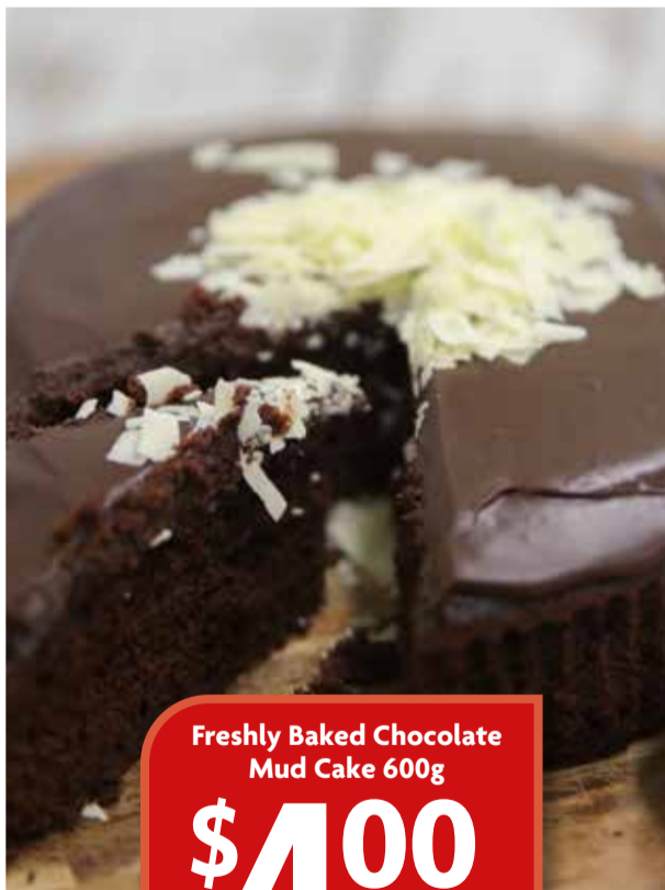
Freshly Baked Chocolate Mud Cake 600g